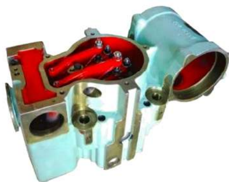
Cylinder Head and components

All the parts (Cylinder heads, Liners, Pistons, Fuel Injection Equipment, Connecting rods, Camshafts, etc.) are EIAPP compliant and with IMO Nos.