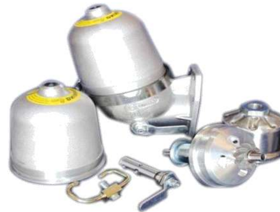
Coupling & vibration damper